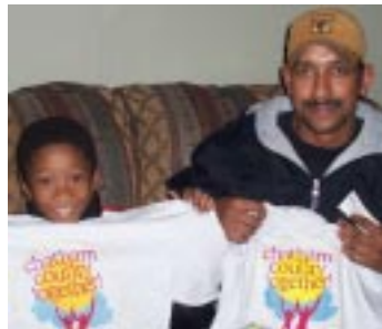
Miracle & Floyd